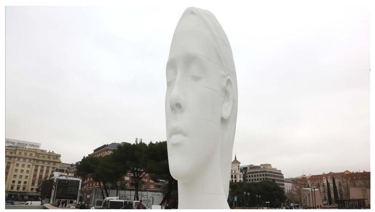
His sculpture, Julia, in the Plaza de Colón, Madrid.

I have always looked for a poetic, internal silence that borrows from the vibrations of our body. This is a worrying silence, including the painful silence of disease and death.