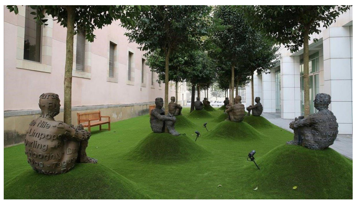
Installation by the Barcelona-based sculptor in the Macba.

The word "utopia." It is what keeps the human being standing upright and proud. Beauty is a utopian concept; we seek it but never reach it. Natural disaster, wars, pandemics occur and something extraordinary happens when we overcome them. This time, it is a lesson in life.